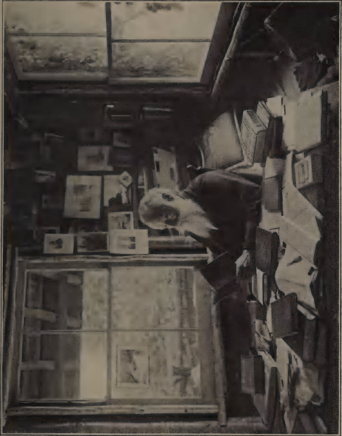
THE LIVING-ROOM, SLABSIDES